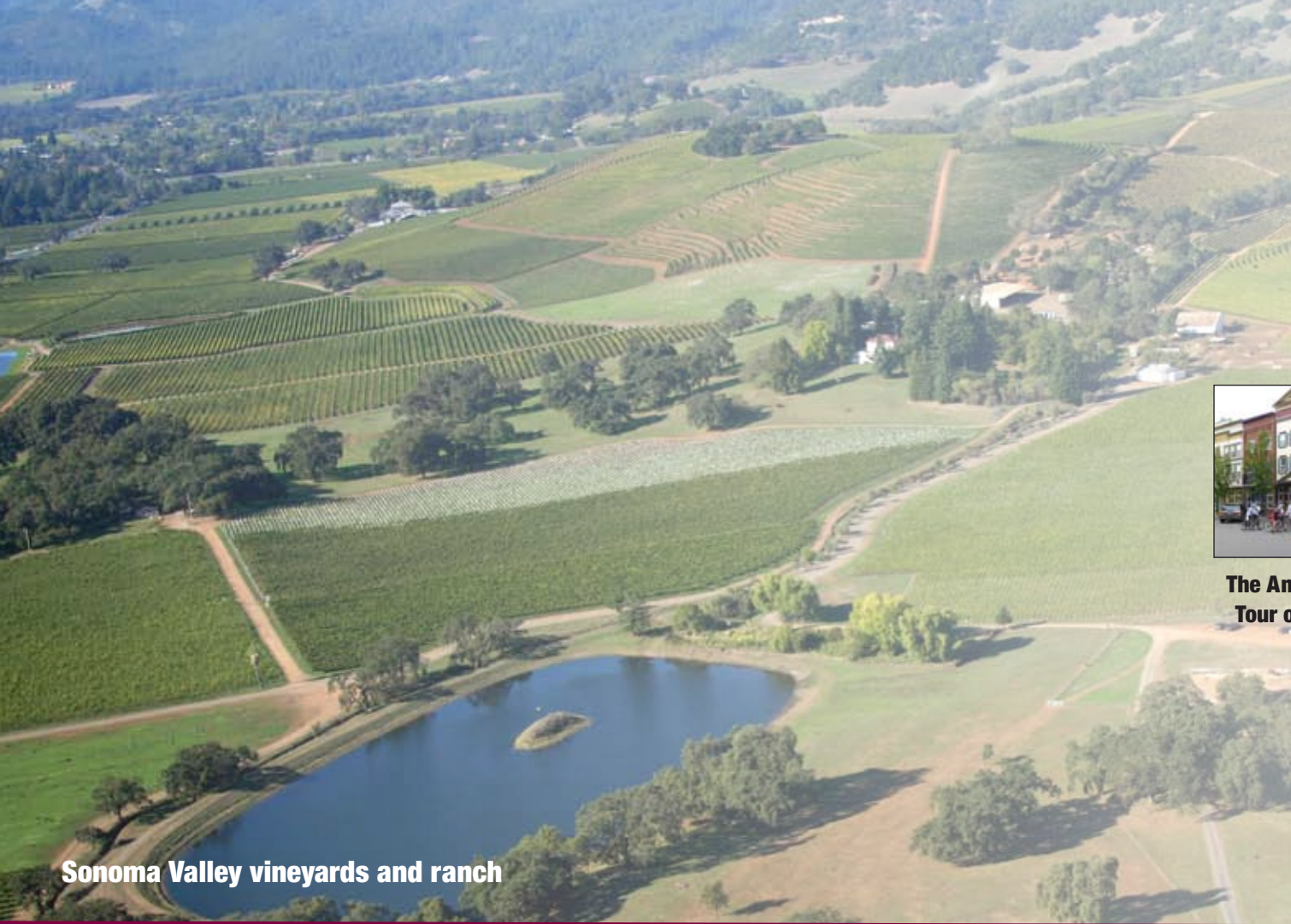
Sonoma Valley vineyards and ranch