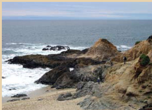
California Wine Country: Sonoma, Napa, Lake and Mendocino Counties