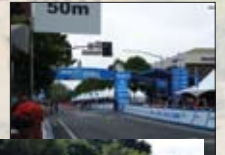
The Amgen Bicycle Tour of California