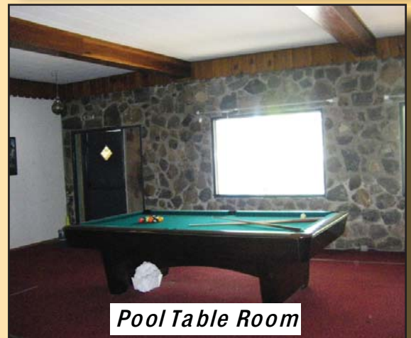
Pool Table Room